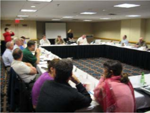
RIMA Membership Meeting 10/06