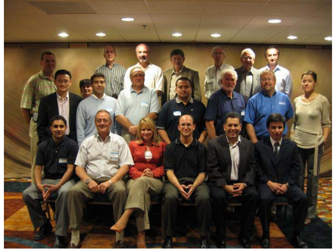
First I-RIMA Meeting with guests from France, United Kingdom, Argentina, Israel, Malaysia, Belgium, Canada and USA.